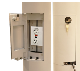
A91591 Lockable In Use GFCI Receptacle Outlet Box