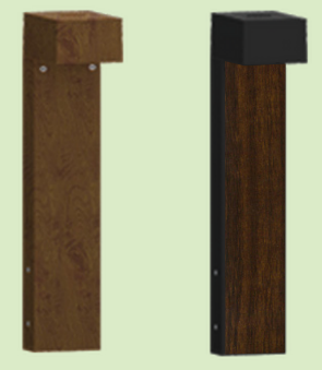
MicroPRIM Finish + Two-Tone Style