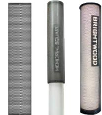
A20131 Perforated Shield [Custom Laser Cutting and Powder Coating Options]