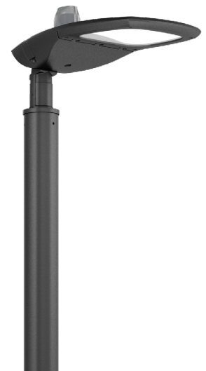
LIGHCONNECT IoT Ready Billund