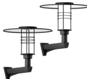
Forrey 20 Ø34.6"