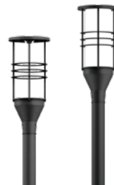
Forrey 16 Ø12.5"