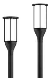
Forrey 15 Ø12.5"