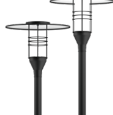
Forrey 12 Ø34.6"