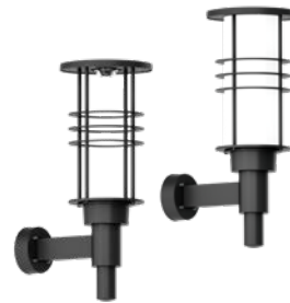
Forrey 24 Ø12.5"