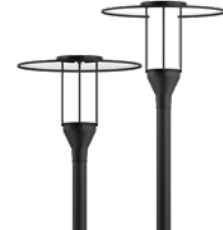
Forrey 9 Ø26"