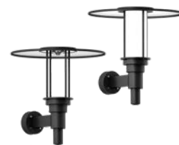
Forrey 17 Ø26"