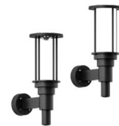
Forrey 21 Ø9.8"