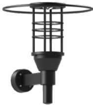
Forrey 34 Ø20"