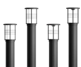
Forrey 8 Ø7.3"