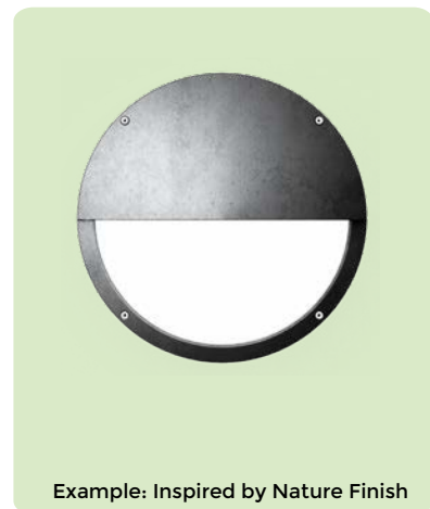
Example: Inspired by Nature Finish