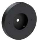
SCDT Surface Conduit Box Trim

Additional Options (Consult Factory For Pricing)